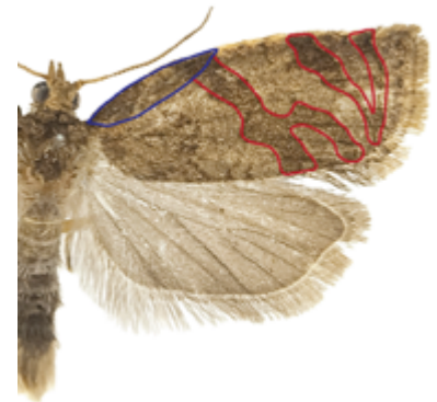
Fig. 9: Adoxophyes orana male; forewing costal fold is outlined in blue; wing markings are outlined in red.