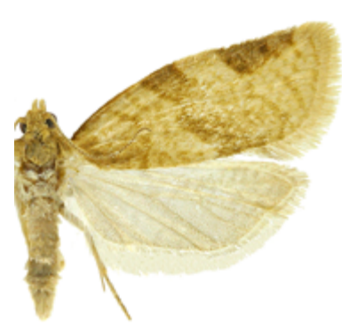
Fig. 19: Clepsipis virescens .