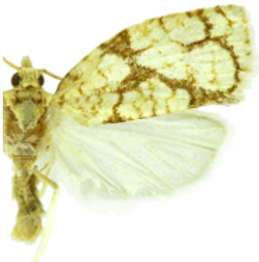
Fig. 14: Adoxophyes negundana .