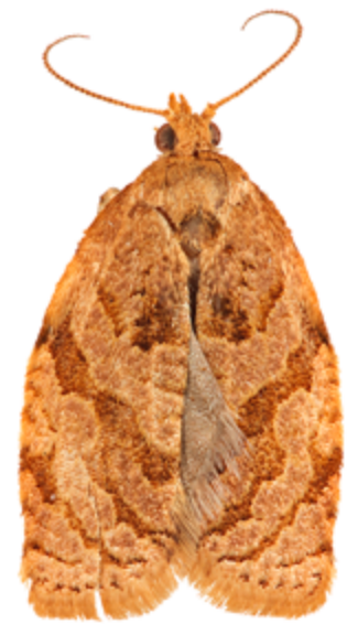
Fig. 1: Adoxophyes orana male.

CAPS Approved Trapping Method: Delta pheromone trap