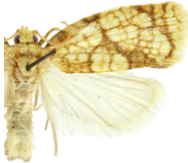
Fig. 12: Adoxophyes furcatana .