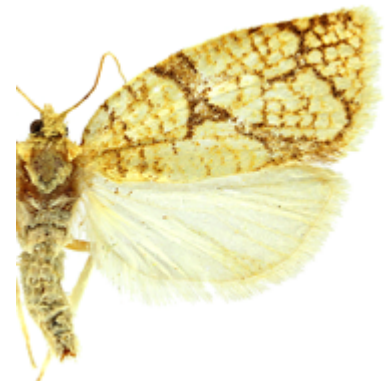
Fig. 13: Adoxophyes furcatana .