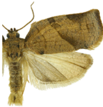
Fig. 18: Choristoneura rosaceana .