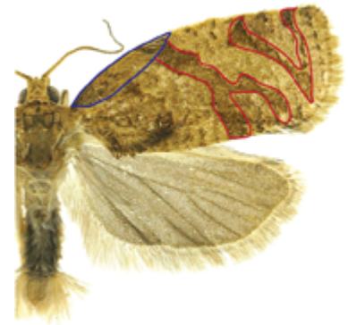
Fig. 8: Adoxophyes orana male; forewing costal fold is outlined in blue; wing markings are outlined in red.

Non-targets likely to be encountered in A. orana traps are illustrated on Page 5. These include two native Adoxophyes : A. furcatana (Figs. 11-13) and A. negundana (Figs. 14-16). Wing patterns are similar to A. orana ; however, the native Adoxophyes tend to have a darker reticulate (“spider-web”) forewing pattern. Another non-target often found in A. orana traps is Choristoneura rosaceana . This is a very common tortricid that is distributed across most of the continental U.S. Forewing pattern ranges from three dark bars across the forewing to a single bar in the middle of the wing and a dark mark on the costa (Fig. 18). All of the non-targets illustrated on Page 5 have a forewing costal fold in the male.