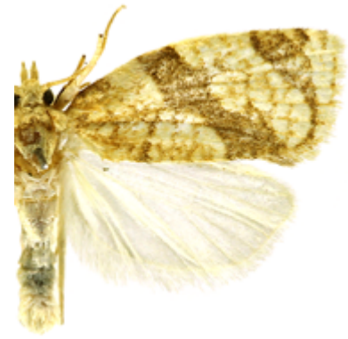
Fig. 16: Adoxophyes negundana .