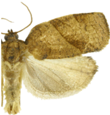
Fig. 17: Choristoneura rosaceana .