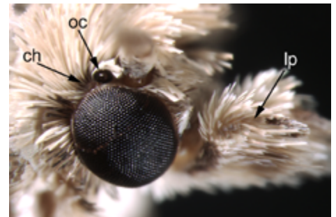
Fig. 6: Tortricid head; ch = chaetosema; oc = ocellus; lp = labial palpi. Note that the chaetosema is above the compound eye behind the ocellus (Photo from Gilligan et al. 2008).