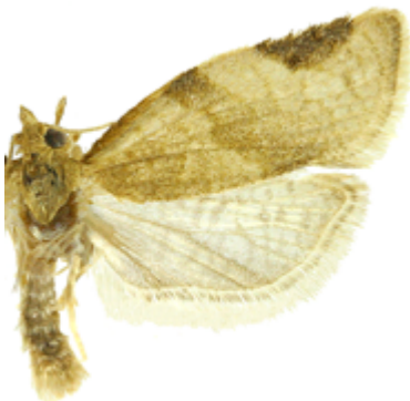
Fig. 20: Clepsipis virescens .

Suspect A. orana specimens (tortricids with a forewing costal fold and wing pattern or coloration similar to the specimens in Figs. 1-2, 4-5, and 8-10) should be sent forward for identification. Specimens must be labeled and carefully packed to avoid damage during shipping.