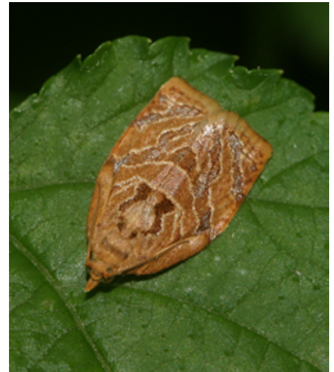
Fig. 5: Live adult in resting position (Photo by Jae-Cheon Sohn, Bugwood.org - 5143071).

Moths meeting the above criteria should be moved to Level 2 Screening (Page 4). Traps to be forwarded to another facility for Level 2 Screening should be carefully packed following the steps outlined in Fig. 7. Traps should be folded, with glue on the inside, making sure the two halves are not touching, secured loosely with a rubber band or a few small pieces of tape. Plastic bags can be used unless the traps have been in the field a long time or contain large numbers of possibly rotten insects. Insert 2-3 styrofoam packing peanuts on trap surfaces without moths to cushion and prevent the two sticky surfaces from sticking during shipment to taxonomists. DO NOT simply fold traps flat or cover traps with transparent plastic wrap (or other material), as this will guarantee specimens will be seriously damaged or pulled apart – making identification difficult or impossible.