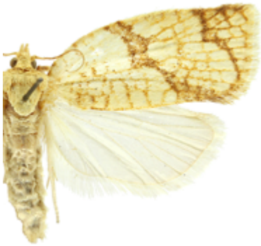
Fig. 11: Adoxophyes furcatana .