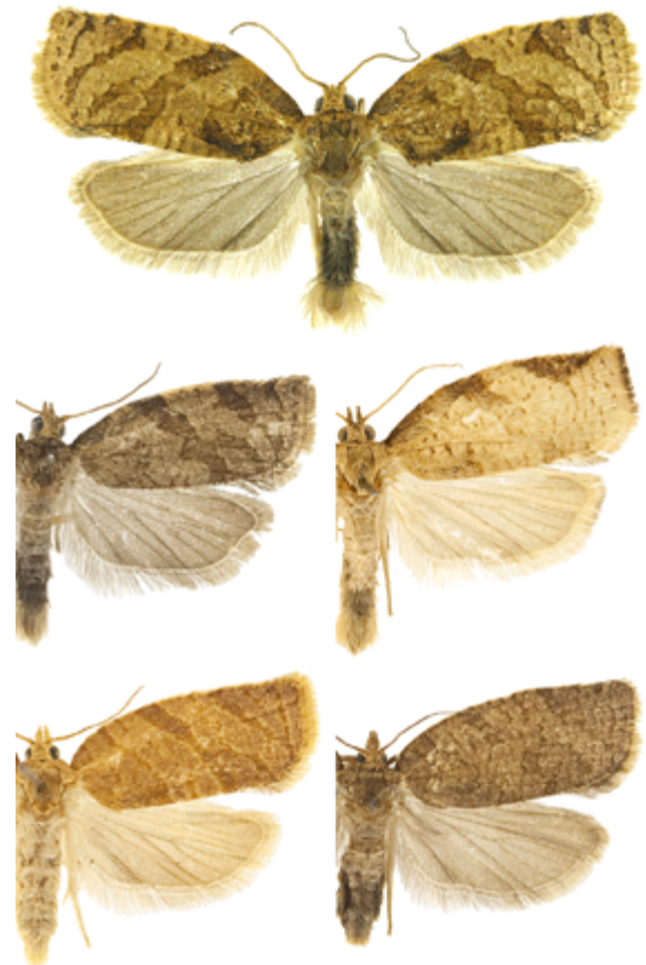
Fig. 4: Variation in wing pattern and coloration of A. orana adults. Wing pattern varies from well-expressed in some individuals to nearly absent in other individuals. Males (top two rows) usually have more well-defined markings than females (bottom row).