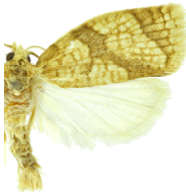
Fig. 15: Adoxophyes negundana .