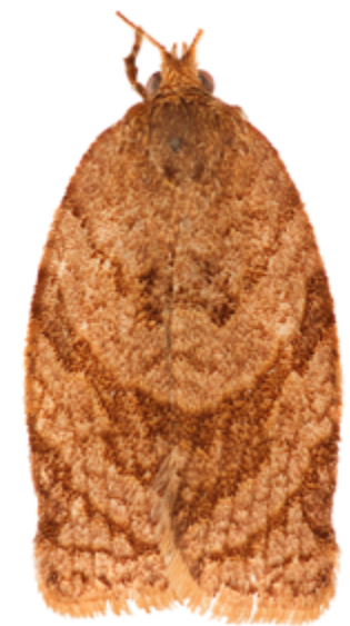
Fig. 2: Adoxophyes orana male.