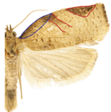
Fig. 10: Adoxophyes orana male; forewing costal fold is outlined in blue; wing markings are outlined in red.